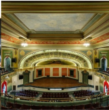
3CDC | Memorial Hall