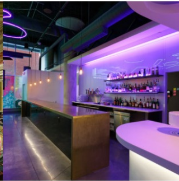
3CDC | Tokoyo Kitty