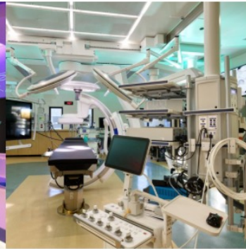
UC Health | Hybrid OR