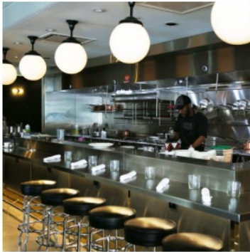
3CDC | Sacred Beast