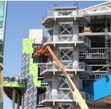
Lindner Tennis Center